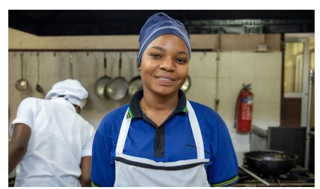
A YES trainee attending sessions on food production.

The trainees were required to contribute 10% of the training fee as a means of motivating them and creating ownership of the training. However, 10% of the training fee appeared to be too high for most trainees, especially for expensive courses, and increased the dropout rates. A fixed amount of 10,000/= TZS (appr. 4 USD) for rural areas and 20,000/= TZS for urban areas was proposed to replace the 10% contribution.