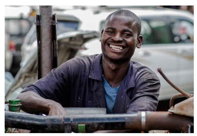
Motor vehicle mechanics graduate in Dodoma region

iii. Projects that are implementing RBF and would like to learn and capitalize experiences from the Tanzania context.