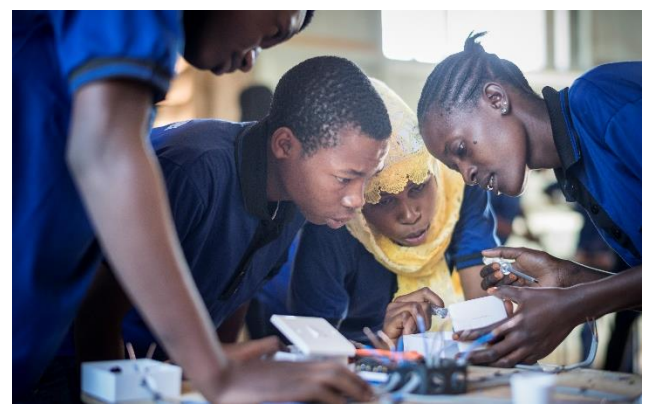
YES trainees doing a practical training in Electrical Installation